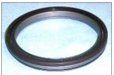
RUBBER-COATED SIDE FACES INSTALLATION TOOL