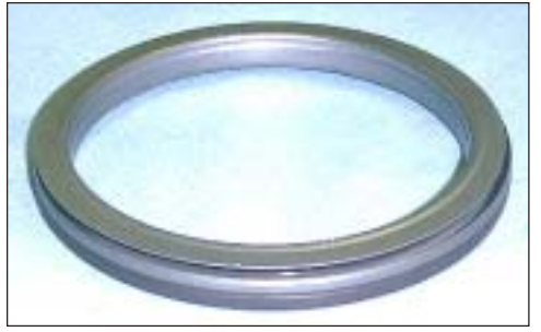
METAL SLINGER SIDE FACES FRONT OF ENGINE