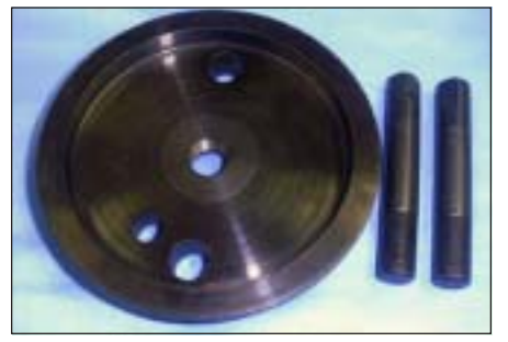
KENT-MOORE TOOL NUMBER J-44590

The new one-piece rear main oil seal is assembled with an integral wear ring during manufacturing.