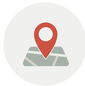
Telematics Gateway (Tracking Device)

Manage your fleet data using your software.