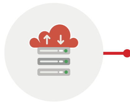
UD Telematics Server